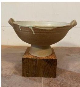
White Ceremony Bowl with Handles W28.5cmxH13.5cm Oatmeal & Clay £148