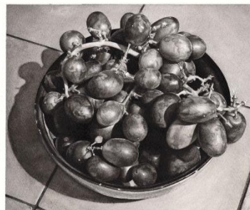
Bowl of Grapes Painting 37x32cm £1100