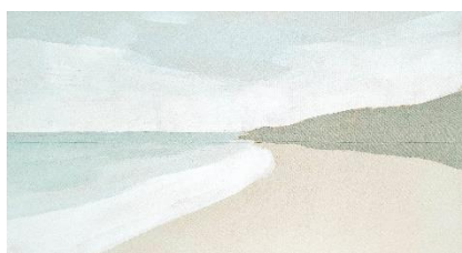
A Bright Morning, Porthminster Acrylic on hand-sewn canvas, framed 63x113cm £2,550