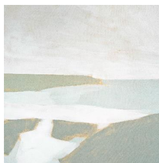
A Study Looking West, Acrylic on canvas, framed 103x103cm £2,750