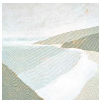
Porthmeor Cove Study Acrylic on Canvas, framed 103x103cm £2,750

'Making an object look like what you see is not as important as making the whole square you paint it on feel like what you feel about the object' Georgia O'Keeffe.