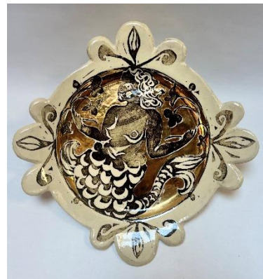
With Hands Dath Spring Trefoil Plate 33x33cm £290