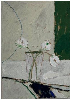
Late Summer Blooms I Oil Painting on Board 20x30cm £550