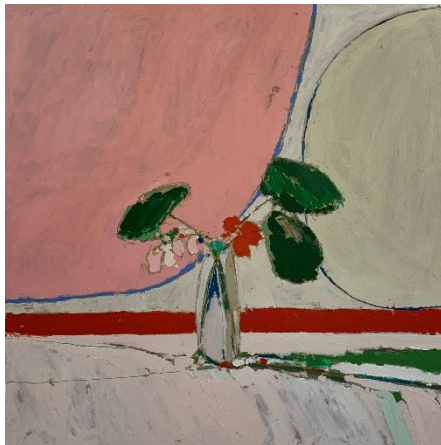
Garden Geraniums on Pink Oil painting on board 60x60cm £1450