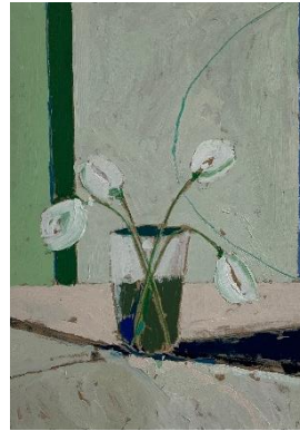
Late Summer Blooms II Oil Painting on Board 20x30cm £550