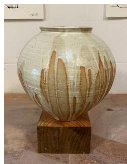
Oatmeal Vase II W22xH24cm £325