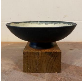
Black and White Ceremony Bowl W27Xh9.5cm £118