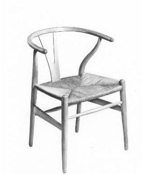
Wishbone Painting 40x30cm £900