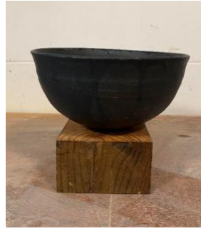
Large Charcoal Bowl W24XH12cm £125