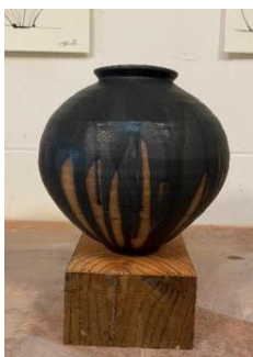
Charcoal Vase I W18xH21cm £265

Wherever possible Shannon uses sustainable ways to create work, such as firing to cooler temperatures, using clean energy and ensuring the clay is sourced responsibly.