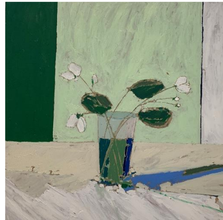
Garden Morel in the Studio Oil painting on board 60x60cm £1450