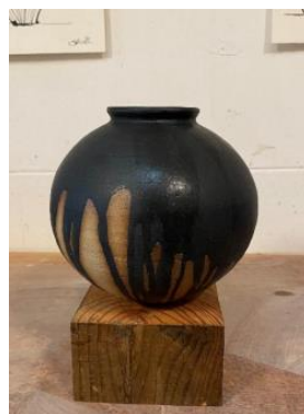
Charcoal Vase II W17xH18cm £245