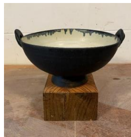
Black and White Ceremony Bowl with Handles W28xH12.5cm Charcoal & Oatmeal £148