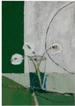
Late Summer Blooms III Oil painting on board 20x30cm £550