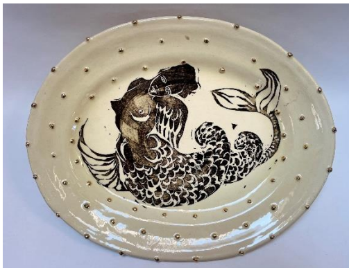
Her Metamorphosis Large Platter 36x44cm £650

Taking inspiration from her inner and surrounding landscape, dreams, poetry, myth, and her experience of being a woman and mother. "Humans have always told stories on pots, I'm excited to continue that tradition, exploring my own myth on functional and timeless objects"