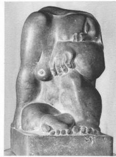
Kauernde Painting 45x35cm £1000