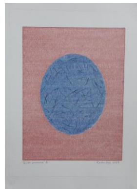
Quiet Presence 3 Framed Drawing 34x29cm £285