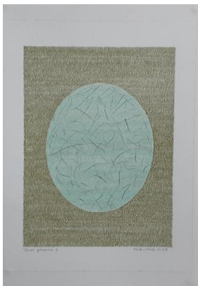
Quiet Presence 2 Framed Drawing 34x29cm £285