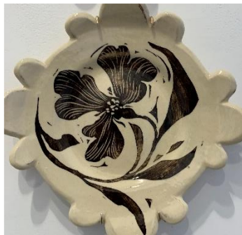
A Flower Small Trefoil Plate 24x24cm £95