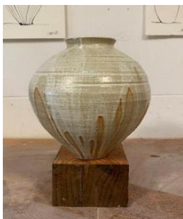
Oatmeal Vase I W19xH22cm £275