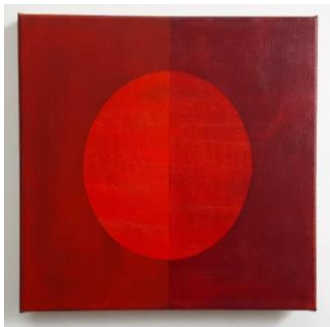
LO Framed Painting 33x33cm £600

The works here were developed from a series of paintings begun in 2022 involving straight lines and strong colour familiar to her practice. Curves began to be introduced into the paintings and this soon led to the inclusion of circles and ellipses. Some of these paintings, the "Unashamedly Beautiful" series, took on a very colourful approach reflecting joy and hope. Meanwhile, contemporaneous drawings were much quieter, inviting the viewer to peaceful contemplation. This contrast she can only explain by the self being forever in flux and her art practice going with this flow.