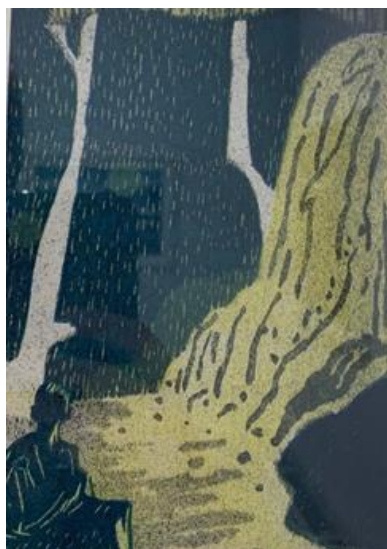
Fluorescent Gush 1/8 ev Approx. 33cm x 22cm £180