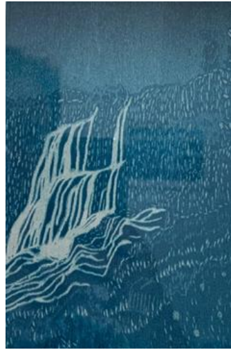
Slip Glimmer 1/4 Approx. 33cm x 22cm £190