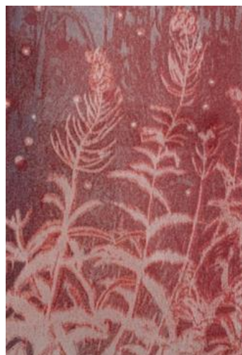
Seed Bomb 1/8 Approx. 33cm x 22cm £180