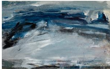
Sea Rhythms (2 and 3)