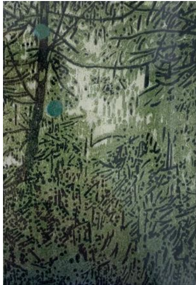
Flitt Flicker 1/8 Approx. 33cm x 22cm £180

Unframed woodcut & lithography print £120