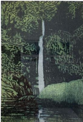
Ice Thread 1/5 Approx. 33cm x 22cm £190