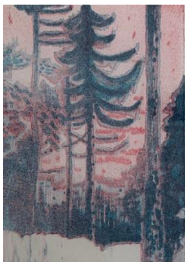
Pink Air 1/8 Approx. 33cm x 22cm £180