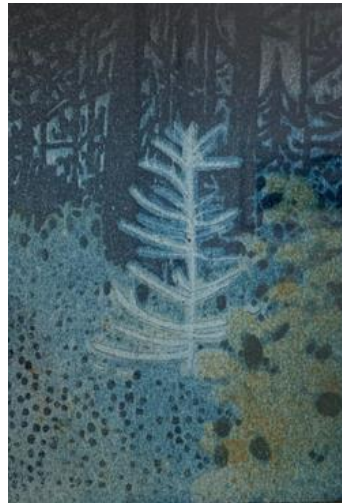
Little Glow 1/6 Approx. 33cm x 22cm £180