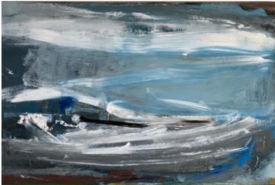
Sea Rhythms (1)