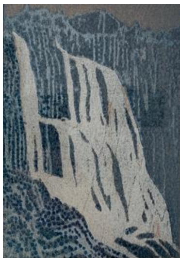
Soft Morning 1/7 Approx. 33cm x 22cm £180