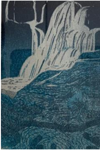
Rush Pool 1/4 Approx. 33cm x 22cm £190