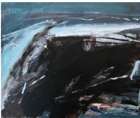
Pendanis – The island St Ives

Acrylic and locally gathered pigment on board