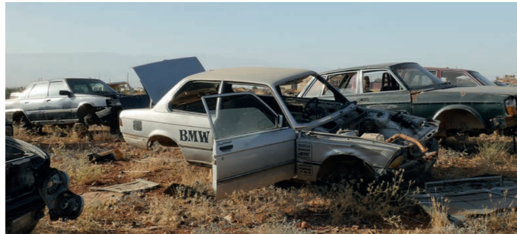
Maeve Brennan, The Drift , 2017. Arts Council Collection, Southbank Centre, London. © the artist. Image courtesy of Chisenhale Gallery.

Simple Truths is part of our New Voices Programme, which gives a platform to members of our community not often heard, through the curation of works from the Arts Council Collection.