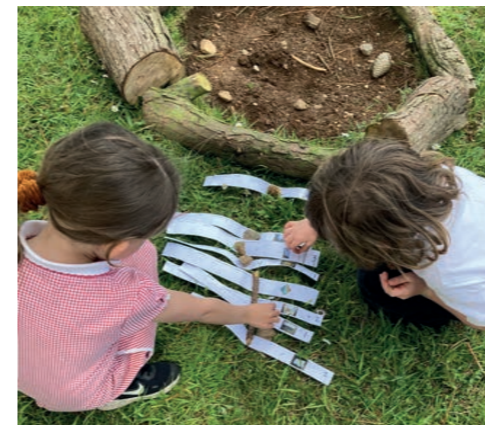
Nandedra School working on Think, Talk, Make Art

We are delighted to be taking art out to nine primary schools, older people, young parents and marginalised people all over West Cornwall. Our partnerships with the Arts Council Collection and the National Portrait Gallery are not only bringing outstanding work to Cornwall, but also supporting people, especially those who have become most isolated, to take part and make art.