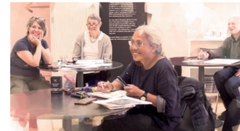
Tea, Cake & Art workshop

Our creative social for older people continues with blended sessions from 22 Feb. You can choose to participate in person from The Studio in the gallery or via Zoom from your home.