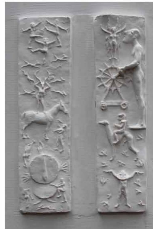
Lot 99 Tim Shaw