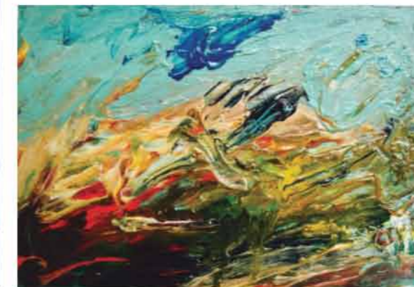
Lot 68 Basma Ashworth