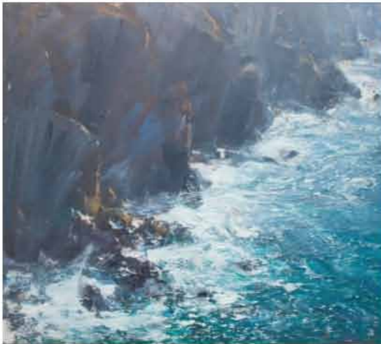
Lot 93 Paul Lewin