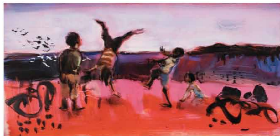
Lot 93 Nicola Bealing