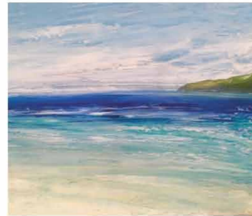
Lot 65 Josh Sim