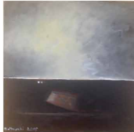
Lot 69 Noel Betowski