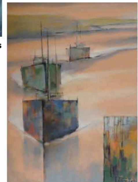
Lot 72 Michael Praed