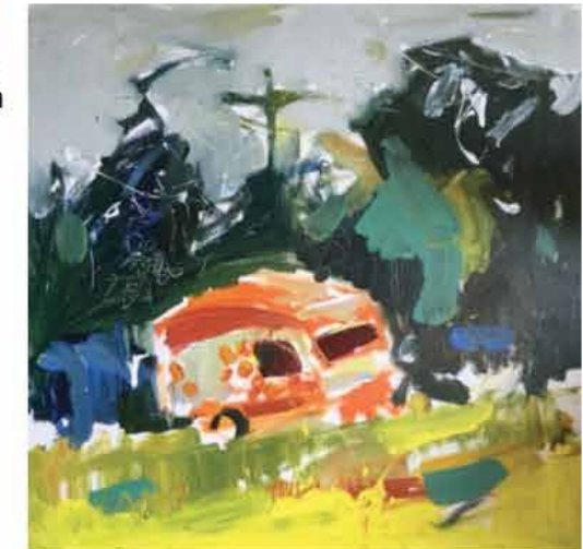
Lot 90 Paul Wadsworth