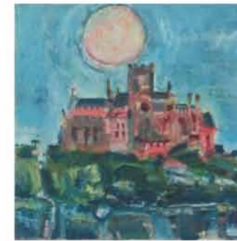
Lot 26 Diane Hadden