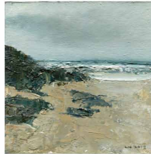
Lot 41 Lesley Ninnes

Father and Child Bronze resin 20 x 15cm. £225 - 375