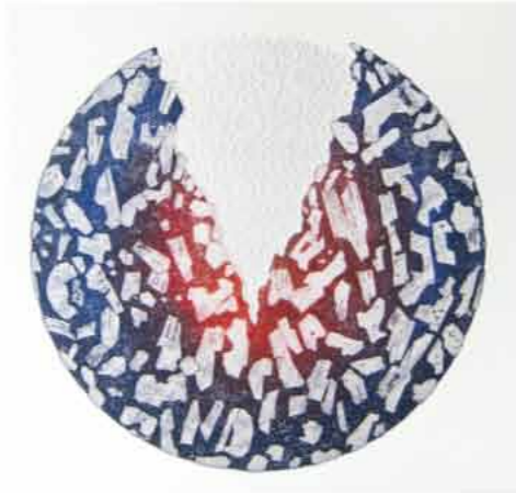
Lot 67 Dan Pyne