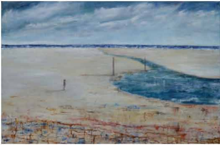
Lot 73 Penny Rumble