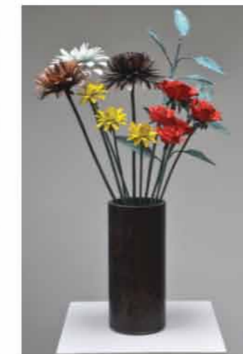
Lot 92 Tom Leaper