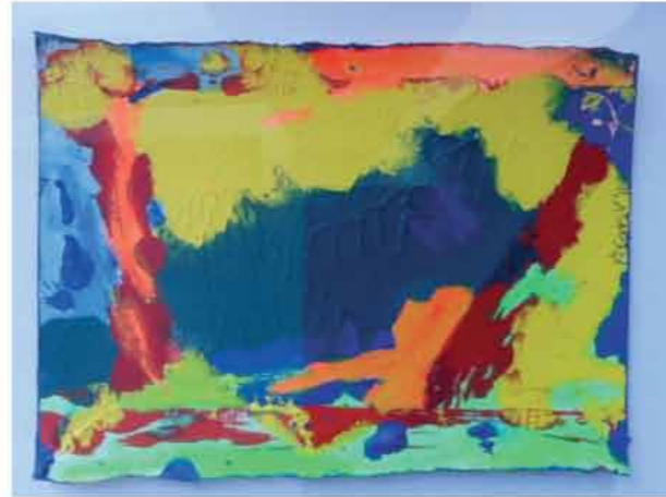
Lot 84 Anthony Frost