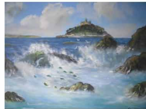
Lot 12 Clifford Yeoman