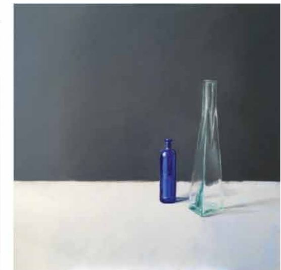
Lot 75 Colin Brown