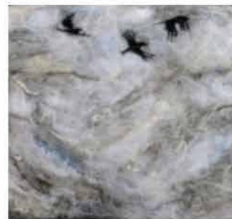
Lot 43 Rowena Scotney