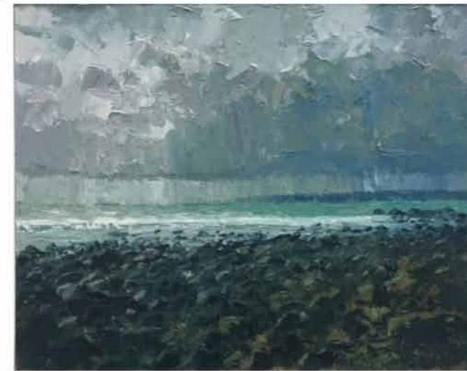
Lot 95 Neil Pinkett