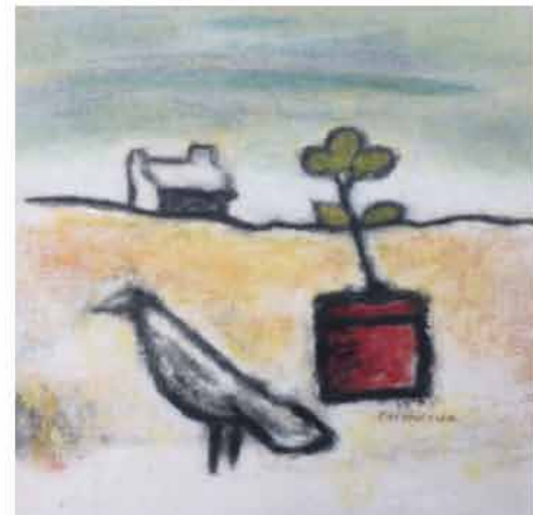
Lot 57 Chema Cruz