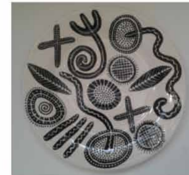
Lot 52 Lincoln Kirby-Bell