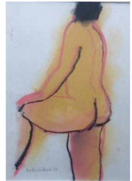
Lot 39 Rod Walker