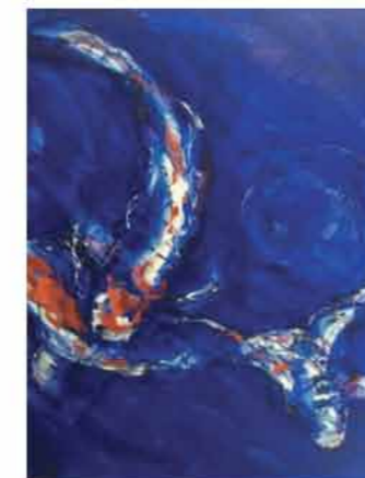
Lot 37 Karrie Fox