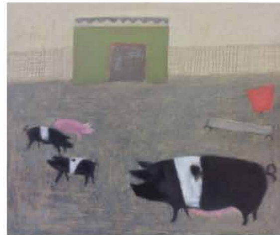
Lot 48 Emma McClure