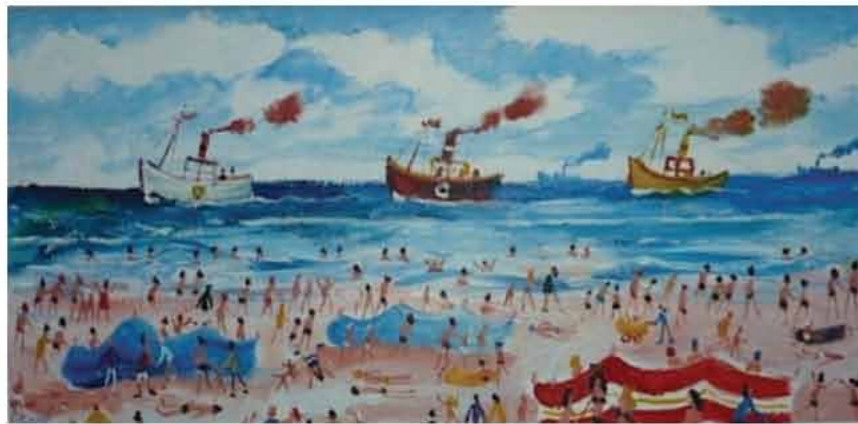
Lot 97 Simeon Stafford