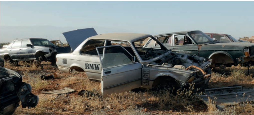
Maeve Brennan, The Drift , 2017. Arts Council Collection, Southbank Centre, London. © the artist.

Simple Truths is part of our New Voices Programme, which gives a platform to members of our community not often heard, through the curation of works from the Arts Council Collection.