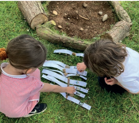
Nancledra School working on Think, Talk, Make Art

We are delighted to be taking art out to nine primary schools, older people, young parents and marginalised people all over West Cornwall. Our partnerships with the Arts Council Collection and the National Portrait Gallery are not only bringing outstanding work to Cornwall, but also supporting people, especially those who have become most isolated, to take part and make art.