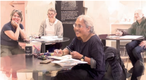
Tea, Cake & Art workshop

Our creative social for older people continues with blended sessions from 22 Feb. You can choose to participate in person from The Studio in the gallery or via Zoom from your home.