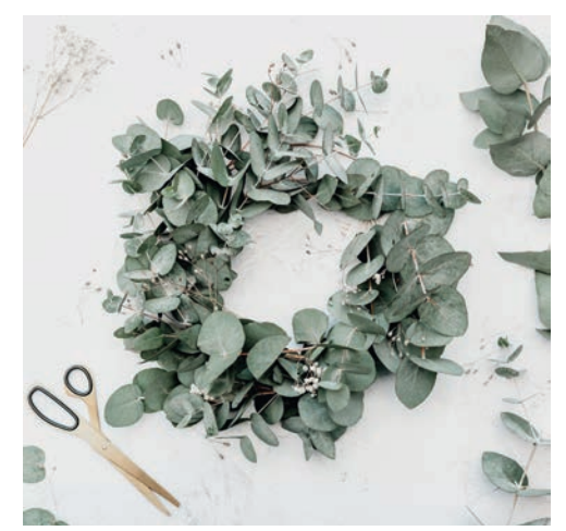
Christmas wreath making