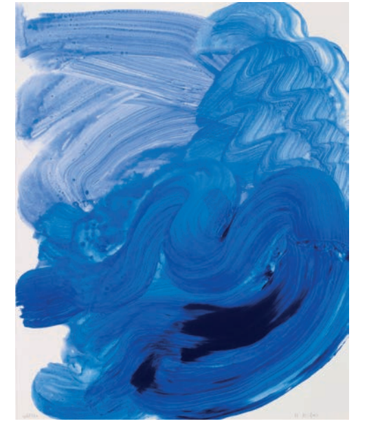
Howard Hodgkin, Swimming, 2011 Arts Council Collection, Southbank Centre, London © The Estate of Howard Hodokin

Cover: Flo Brooks, Butts Only (that's the sound that lonely makes) 2018. Arts Council Collection. Southbank Centre, London, © the artist.