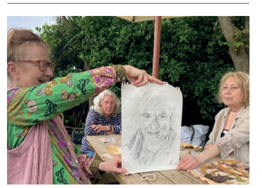
Social Prescribing Group

Thank you for your ongoing support of creativity across our community.