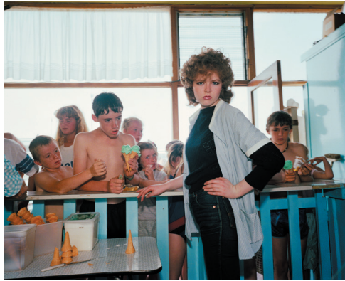
Martin Parr, New Brighton, England , from The Last Resort , 1983–85