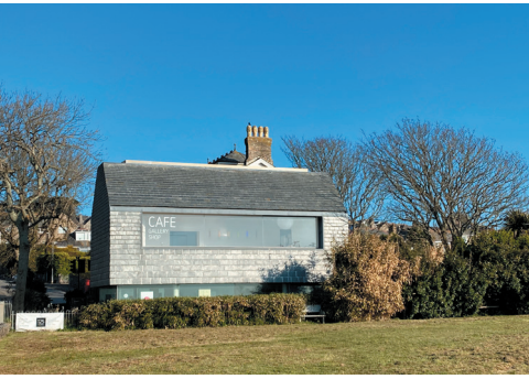
Newlyn Art Gallery

We are so delighted, after such a challenging time, to be able to explore art again with our local schools, with groups such as WILD Young Parents, with the Intercom Trust and hundreds of individuals.