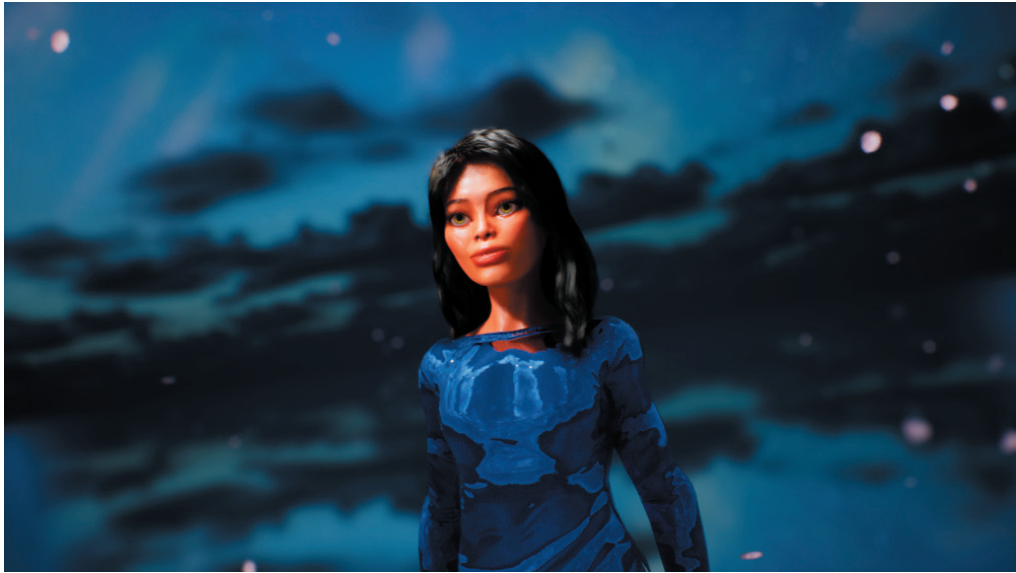
Still from Keiken's Viral Energy Game .

Outside The Algorithm offers a lively space for interaction and reflection, with a range of media and artworks including interactive projections, a controversial electric-acoustic radio album, experimental film from international female artists, creative coding, and meditative GIFs.