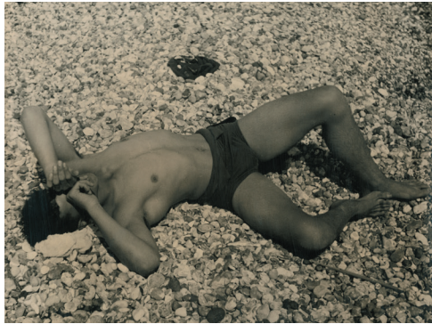
Keith Vaughan, Lotus Eater, c.1939