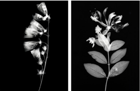
Digitalis and Lonicera Periclymenum by William Arnold

Island Bodies is a reflection on islands, human and non-human bodies: their fluids, and where they overlap.