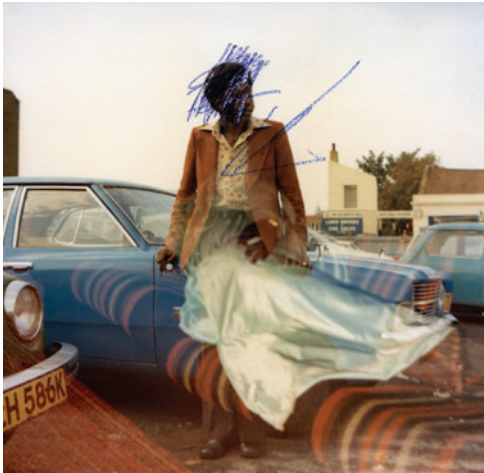
Karl Ohiri, How to Mend a Broken Heart , 2013 Arts Council Collection, Southbank Centre, London © the artist