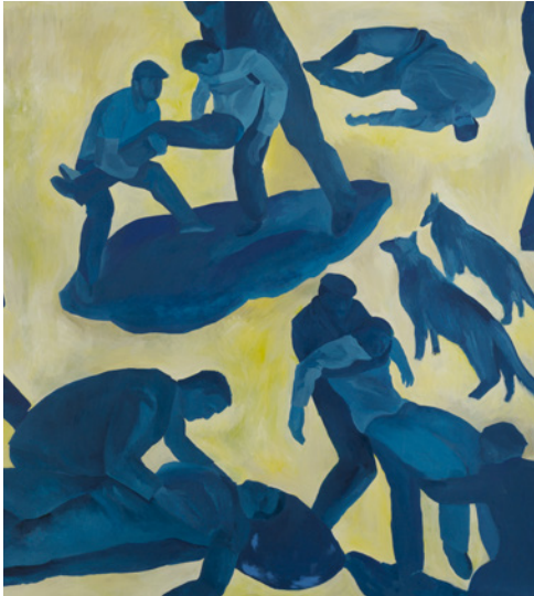
Joanna Price, Blue Pietà , 1992 Arts Council Collection, Southbank Centre, London © the artist's estate. Gift of Charles Saatchi, 1999

Newlyn Art Gallery & The Exchange is an Arts Council Collection National Partner. The Arts Council Collection is managed by Southbank Centre, London on behalf of Arts Council England.