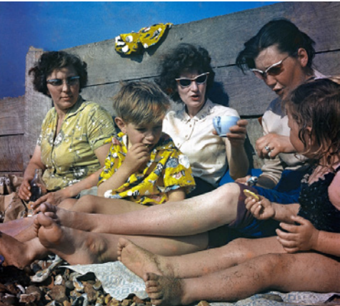
Image: Down to the Beach (detail).

This major exhibition looks at the relationship between photography and the British seaside from the 1850s to the present day. Images of the beach, hotel life, the holiday camp, dressing up and dressing down, wild waves and coastlines all combine to create a rich picture of British resorts.