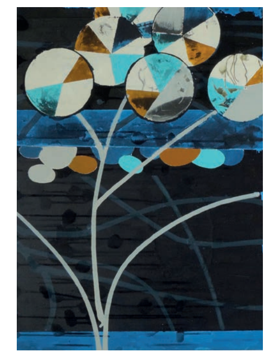
Wayfinder Blue by Mark Surridge

The Picture Room shows monthly changing exhibitions of works for sale by Cornwall-based artists.