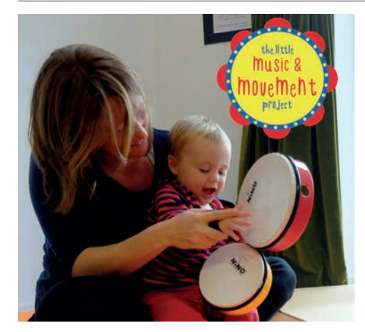
Fun and creativity