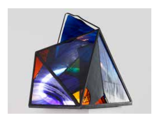
Peter Lanyon, Colour Construction. 1960. Arts Council Collection, Southbank Centre, London © Sheila Lanyon

A Certain Kind of Light explores how artists from the 1960s to the present day have responded to light, in paintings, sculpture, photography and installation.