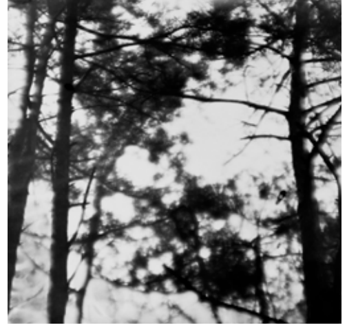
Forest Obscura III © Oliver Raymond-Barker

The Picture Room shows monthly changing exhibitions of works for sale by Cornwall-based artists.