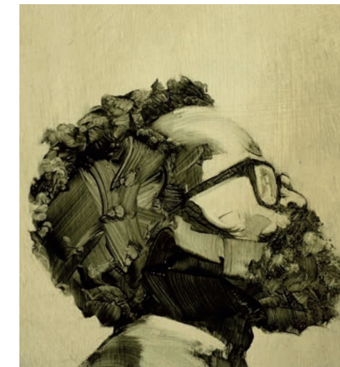
(detail) Shelly Tregoning, Black is the New Black