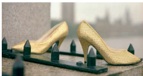
(detail) Palace of Westminster, London, from the series Cinderella Tours Europe © Joy Gregory

Joy Gregory is one of the most significant artists to emerge from the Black British photography movement of the 1980s. This major retrospective brings together 16 bodies of work exploring race, history and gender, encompassing a wide range of photographic media, from digital video installations to Victorian printing techniques.