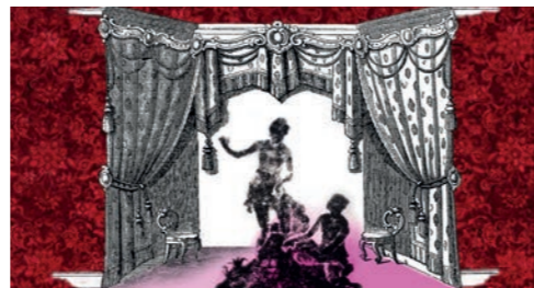
The Palace of Culture, featuring detail of work by Naomi Frears

• Check our website and social media for updates on each week's programme of events.