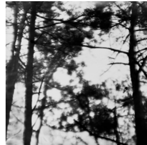
Forest Obscura III © Oliver Raymond-Barker

The Picture Room shows monthly changing exhibitions of works for sale by Cornwall-based artists.